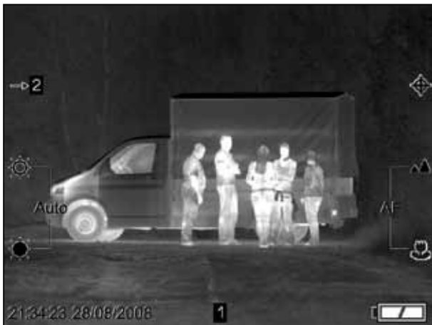
Identification of people in front of a vehicle