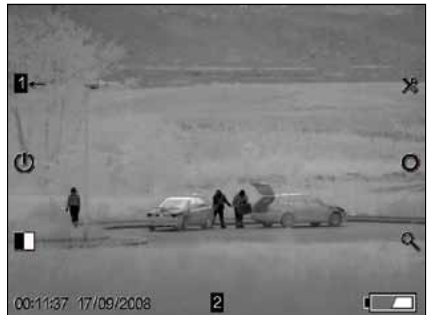
Surveillance and intelligence