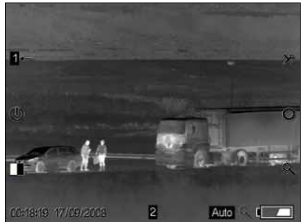
Surveillance and intelligence