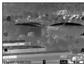
Civil defense and emergency management