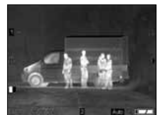
Identification of people