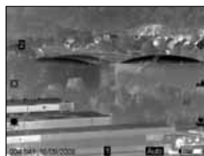
Civil defense and emergency management